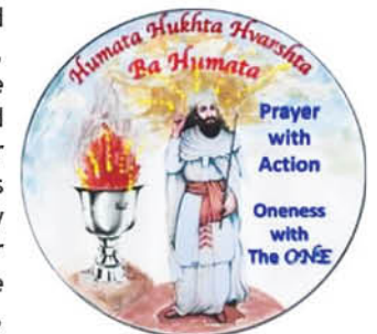
Ba Humata Flame of Fellowship of Collective Consciousness