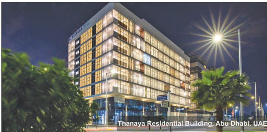
Thanaya Residential Building, Abu Dhabi, UAE