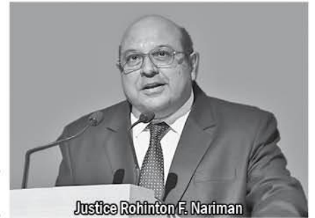
Justice Rohinton F. Nariman

NCPA presents the third Jamshed Bhabha Memorial Lecture titled, 'Gods, Demons and Heroes' - the parallel epic dramas of the Mahabharata and Wagner's Ring Cycle by Justice Rohinton F. Nariman, Former Judge, Supreme Court of India - a great personality with a deep knowledge of diverse subjects, and a passion for Western Classical music. The fascinating comparison will make for interesting hearing. This free event is scheduled at 6:00 pm on Sunday, August 21, 2022 at Tata Theatre. Passes to be collected from Box Office.