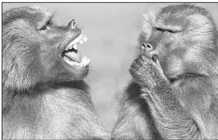
Monkey on left: I have a toothache, can you see the tooth that's bad? Monkey on right: No! I'm afraid you'll bite off my head!!