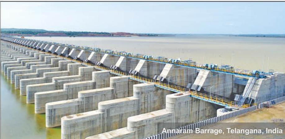
Annaram Barrage, Telangana, India