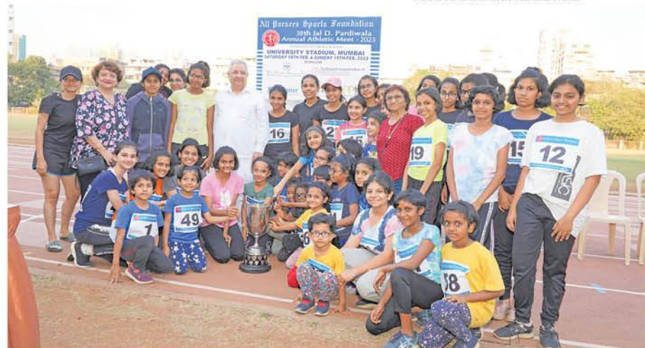
Bai Avabai F Petit Girls High Schools - Team Champions, Girls