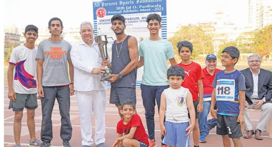
Bombay Parsi Panchayet - Team Champions, Boys